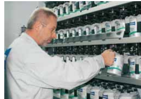
Expertise and craftsmanship are key to an excellent refinish.

In order to emulate the constantly growing number of colors for refinishing purposes, the paints industry developed mixing systems. Current automotive refinishing is characterised by environment- and user-friendly systems allowing for reduced stock keeping while offering a higher yield and ensuring improved safety with regard to the environment and the people