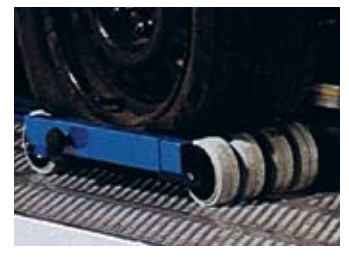
The loading trolley allows you to load immobilized vehicles and can also be used as a vehicle safety stop (just flip it over).