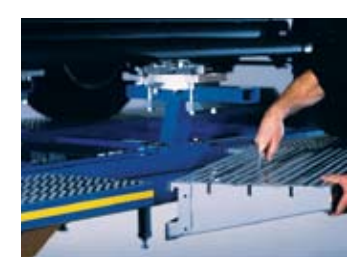
Removable ramp sections lift out easily to give better access to the vehicle.