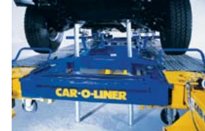
Powerful 10-ton Draw-Aligners pull from almost any angle 360<sup>0</sup> around the vehicle.