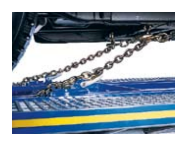
When repairing minor damage, the vehicle can be quickly anchored using B631 chain holders.