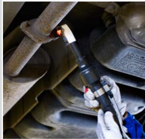
Heat rusted nuts and bolts on suspension, steering and exhaust.