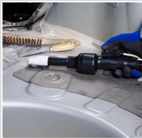
Heats through rubber or plastic.