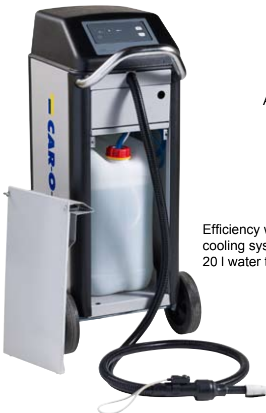
Efficiency water cooling system by 20 l water tank.