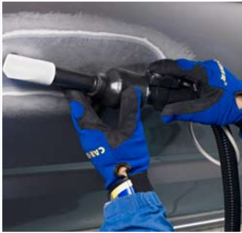
Heat shrinking of steel and aluminum panels during repair